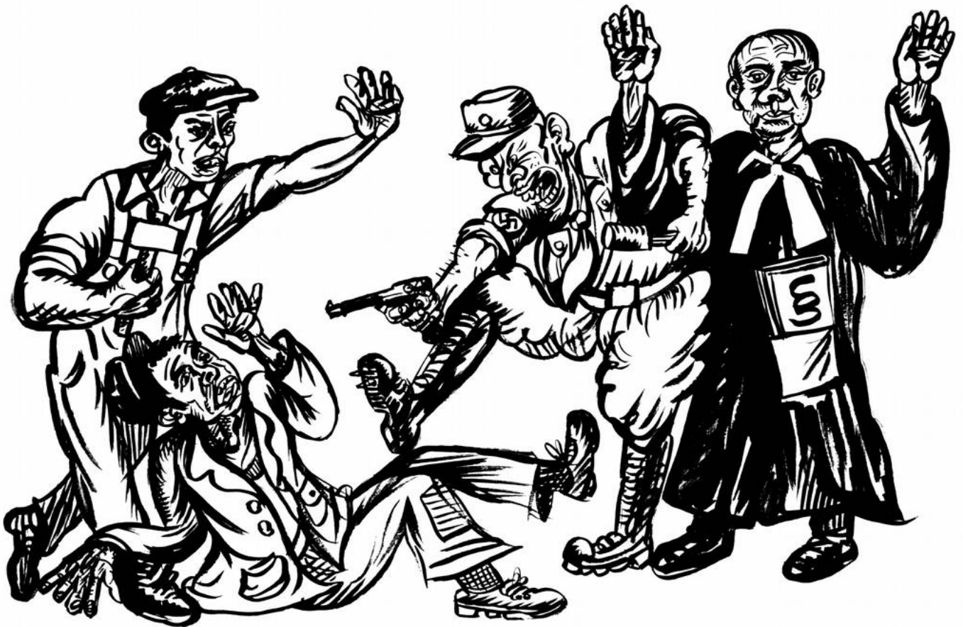
Drawing of the intervention by communist activists at the NSDAP gathering January 13 1930 in Emden.