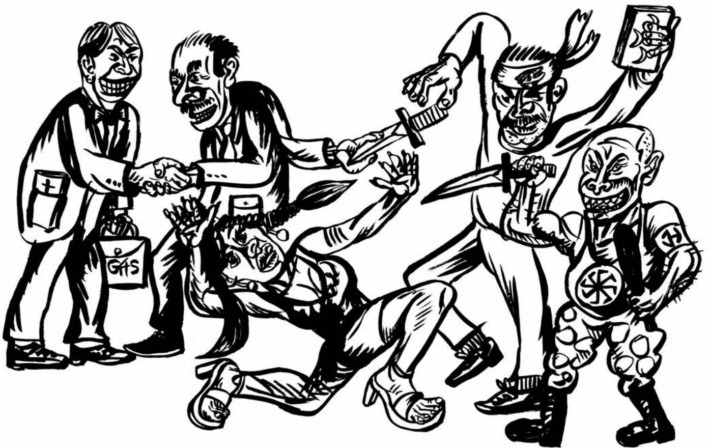
Drawing from worksheet no. 2: "The Deal"