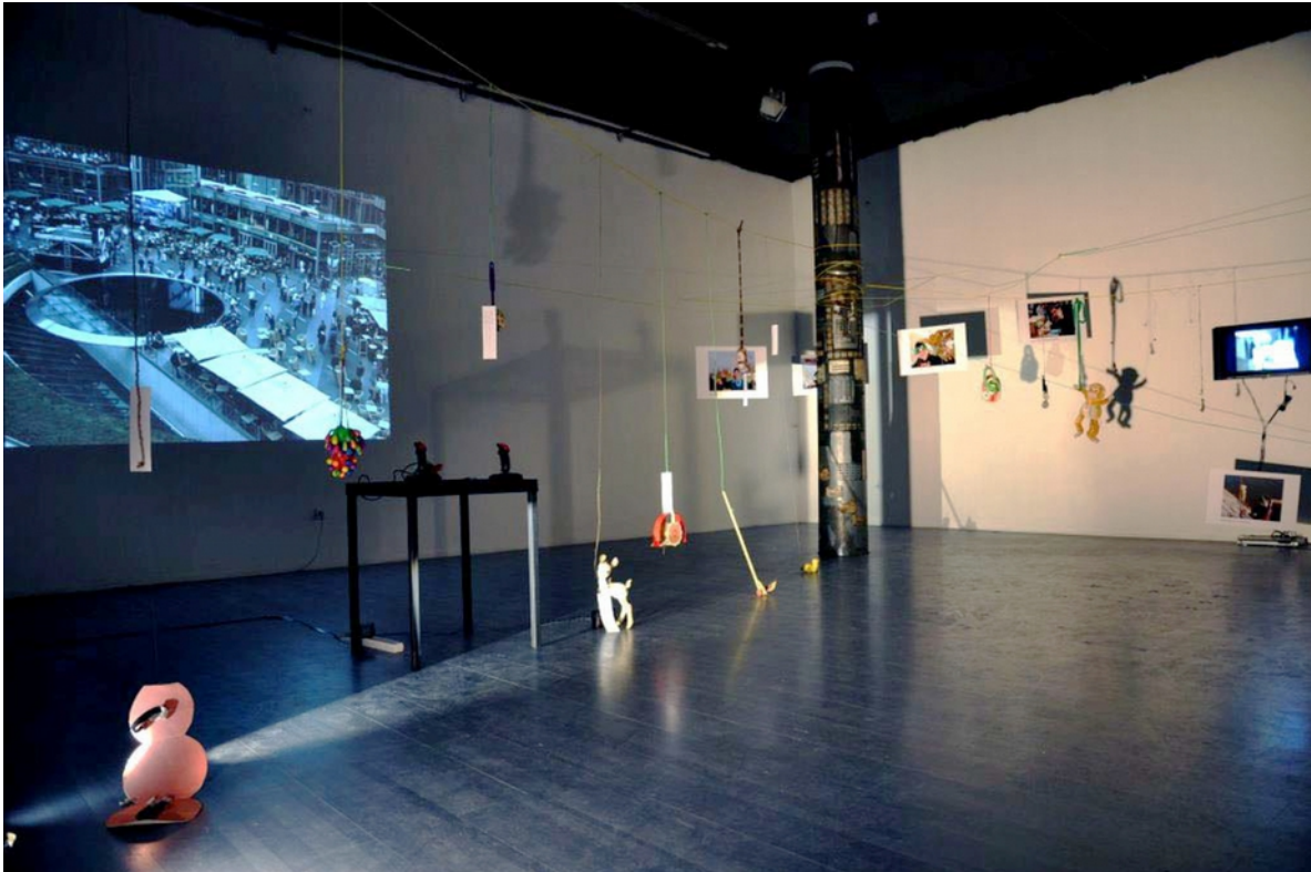
Video Potsdamer Reloaded and Sendi Installation . Solo show Psychogeographical Research , Museum of Contemporary Art of Vojvodina, Novi Sad, Serbia, 2009.