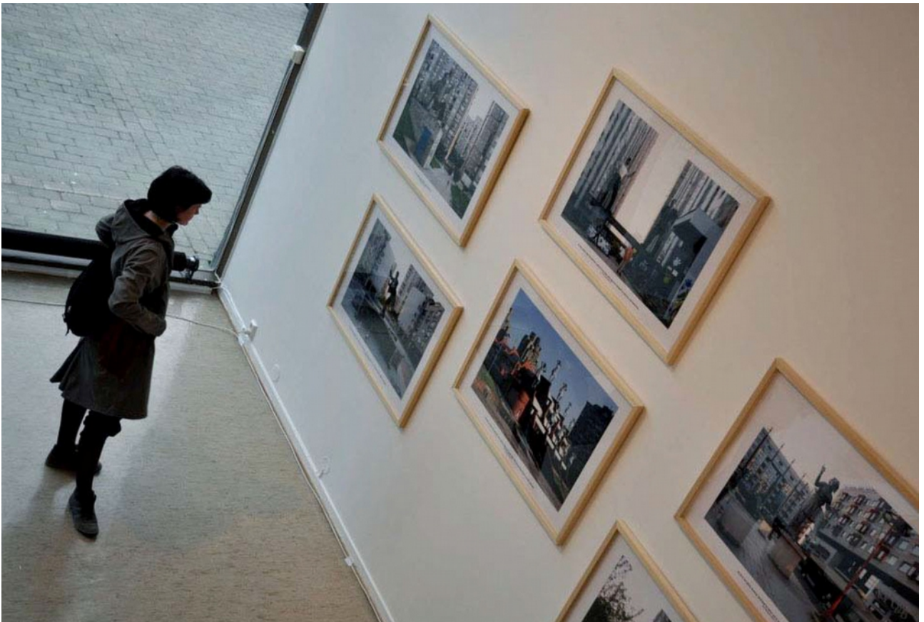
Exhibition view Reality Check , Trøndelag Senter for Samtidskunst, Trondheim, Norway, 2010.