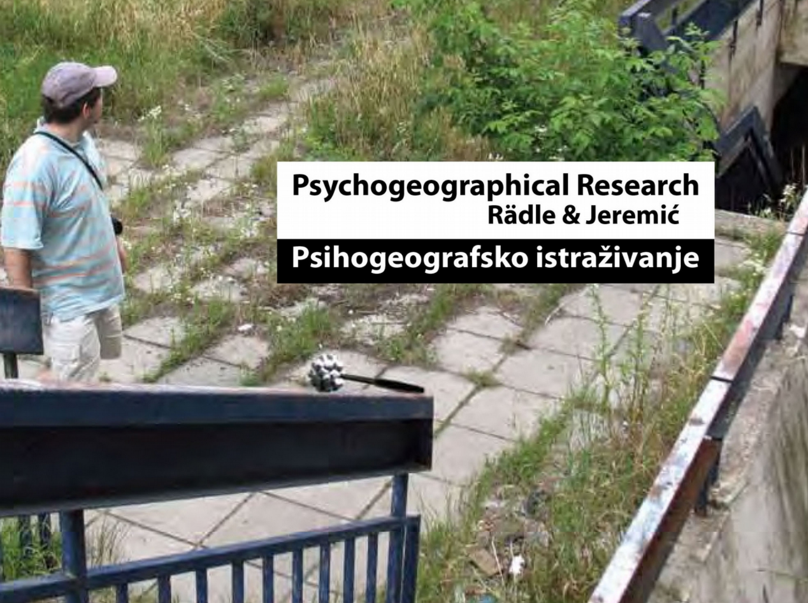
Cover of the exhibition catalogue Psychogeographical Research , Museum of Contemporary Art of Vojvodina, Novi Sad, 2009.