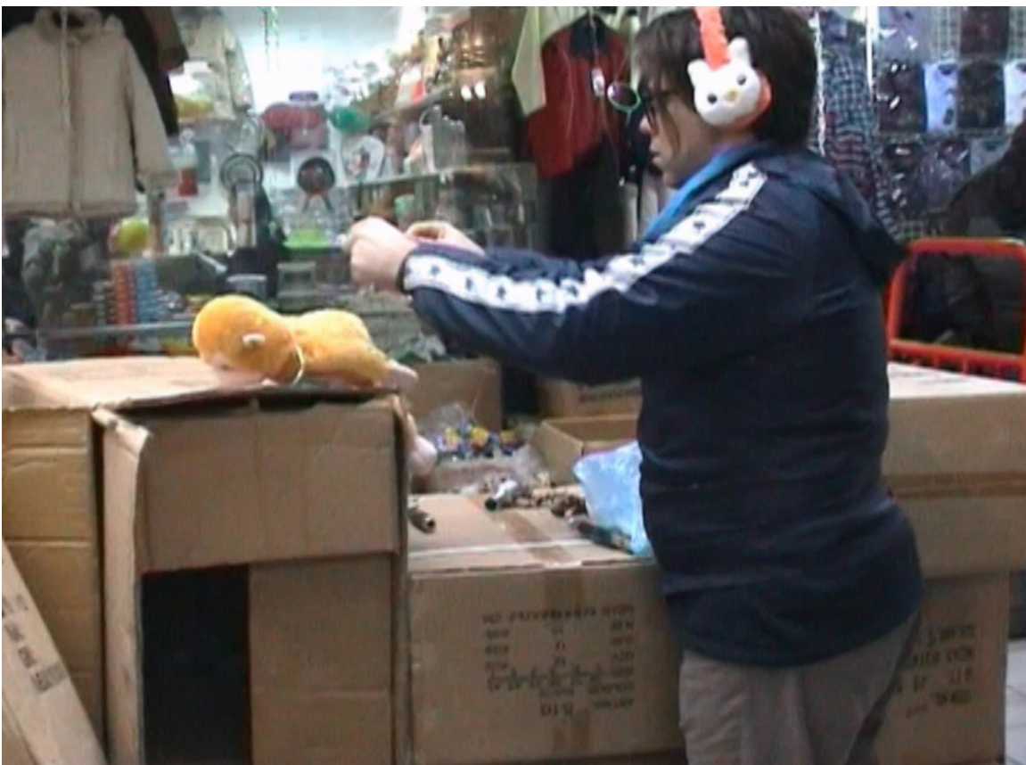
Sendi , intervention at the Chinese market, video still, Belgrade 2003.