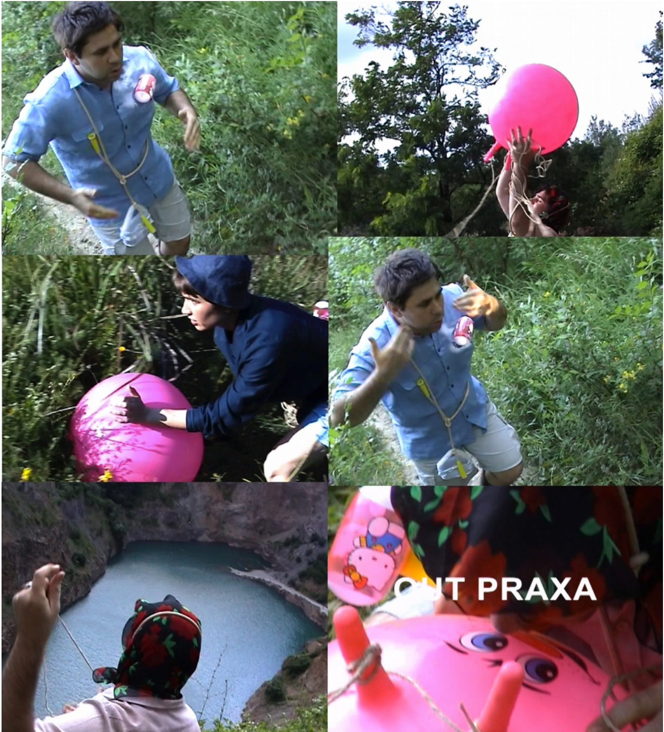
Video stills from OUT PRAXA , Novi Sad 2004.

http://issuu.com/vladanrena/docs/psychogeography