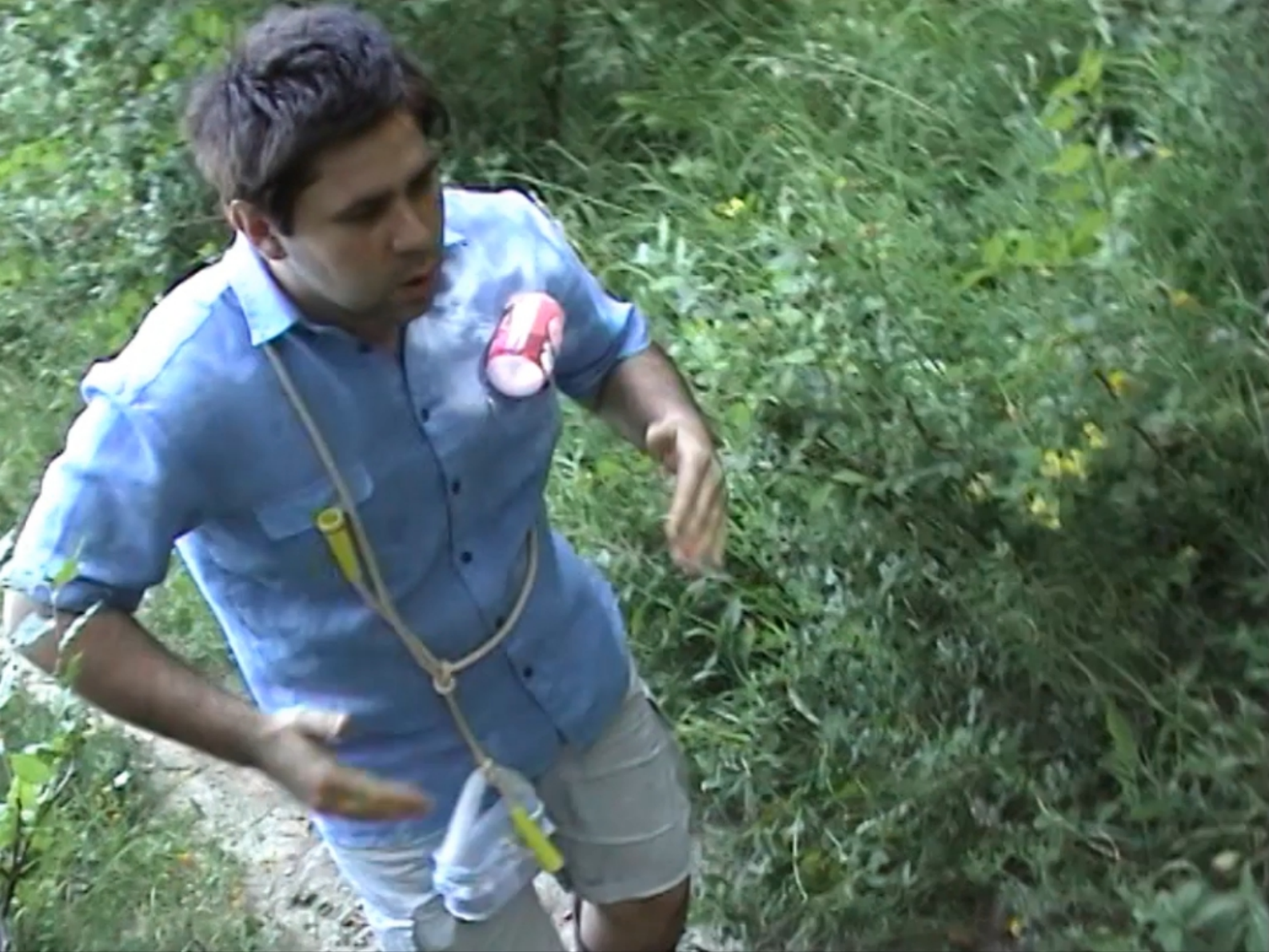
Video still from OUT PRAXA , 2004.