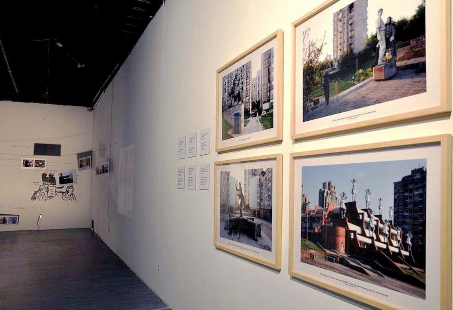
Exhibition view of the Monument Series , Solo Exhibition Psychogeographical Research , Museum of Contemporary Art of Vojvodina, Novi Sad, 2009.