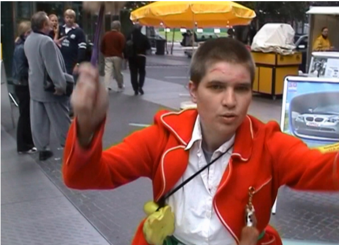
Intervention Horrorkatze macht Terror , video still from Potsdamer Reloaded , Berlin 2003.