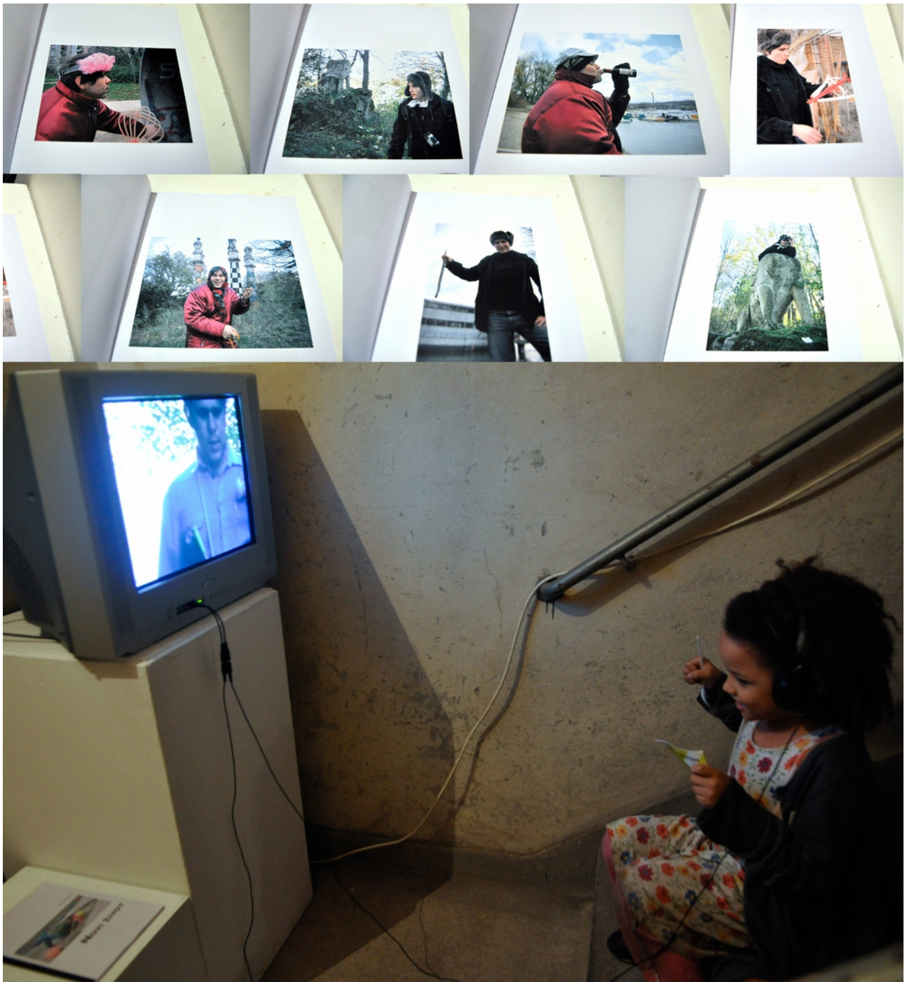
Photo book Novi Život - New Life and video OUT PRAXA . View from the group exhibition Schutzraum. Politik, Ästhetik, Medien, Thealit , Bremen, September 2013.